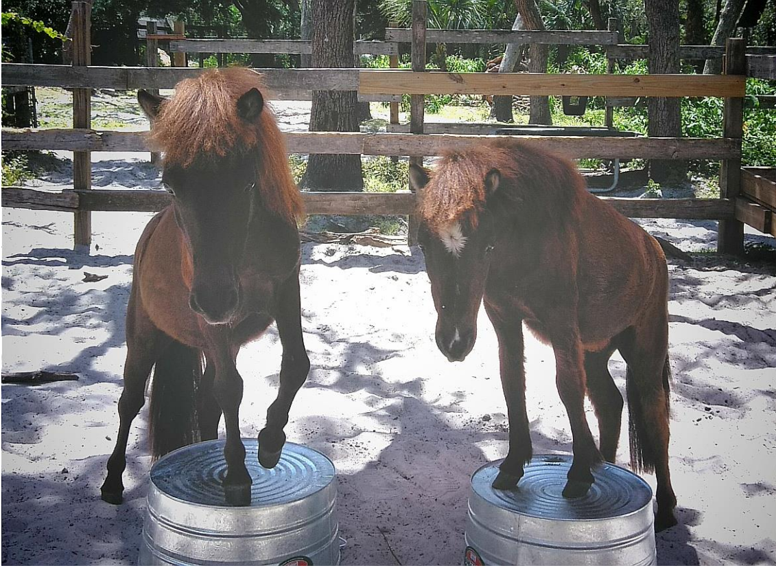
The miniature horses Jonah and Joshua take jumps and get on their stage.