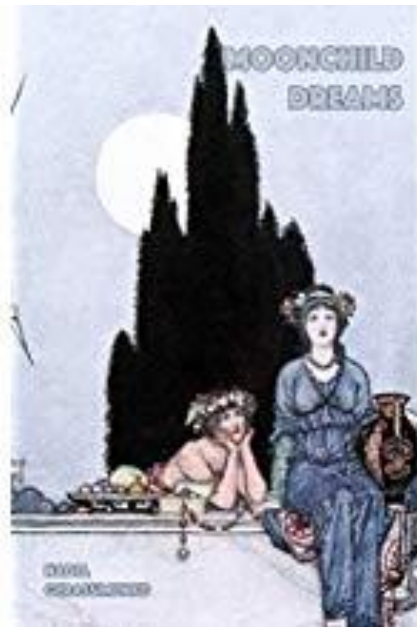
Nadia's first chapbook, Moonchild Dreams