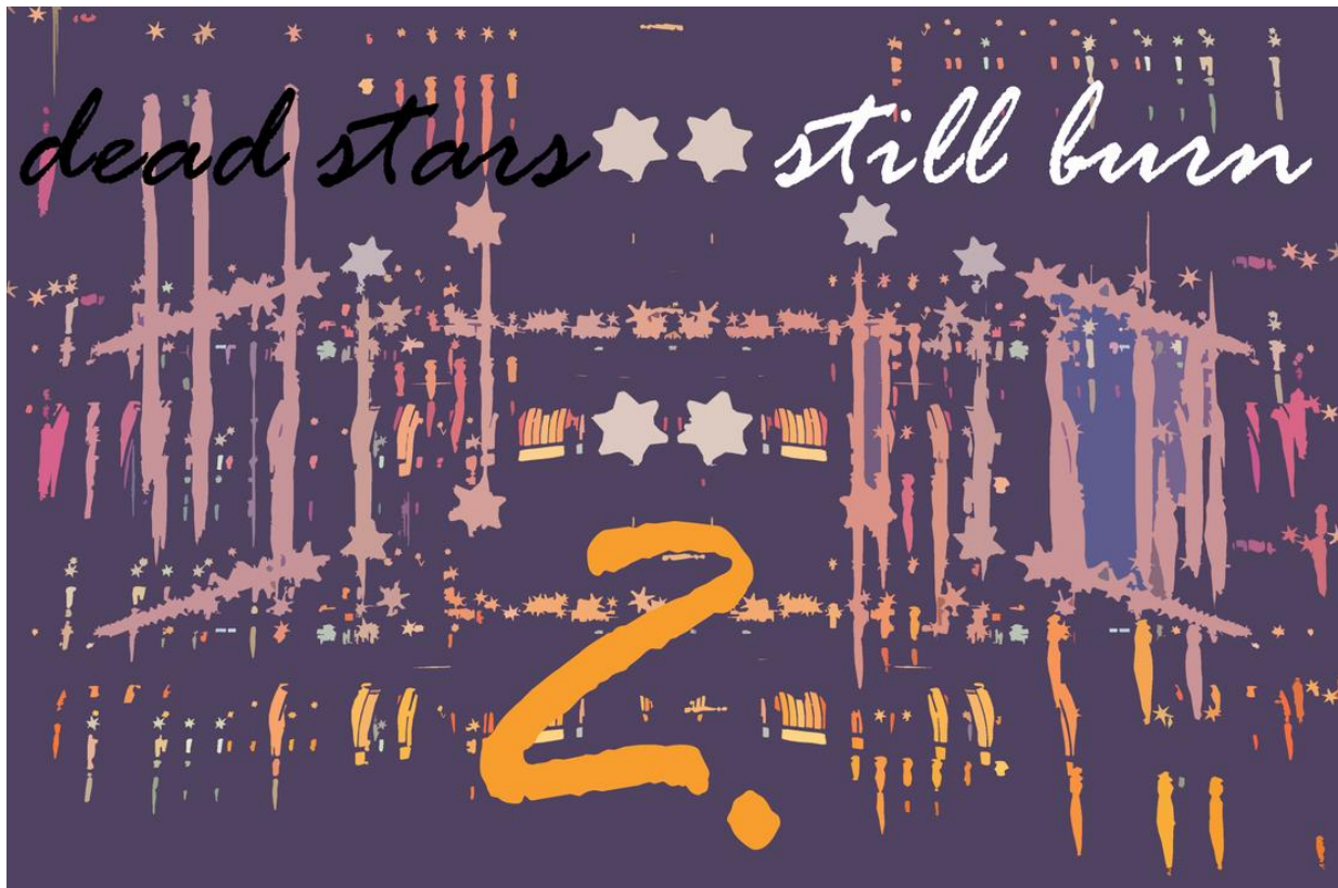
Second issue design